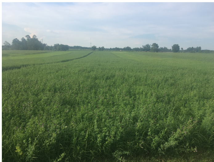
Figure 1. Research plots at the University of Georgia Coastal Plain Experiment Station in Tifton, GA were established in February 2016. Ten 0.5-acre plots were designated as either 'Tifton-85' bermudagrass or 'Tifton-85' bermudagrass interseeded with 'Bulldog 805' alfalfa.

Because of an extraordinarily warm fall in 2015 that encouraged the Tifton 85 to grow well into early winter, the plots were established in February of 2016 instead of the normal fall establishment recommended for alfalfa in this area. Despite the late start, the alfalfa established well. Harvests occurred during May, June, July, August, September, and November in 2016. Since this was the establishment year for the alfalfa, the T85+N treatment produced more tonnage in this first season than the T85+Alf mixture (10,569 vs.