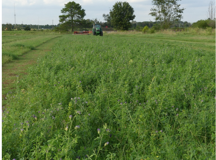
Figure 4. An 'T85-alfalfa' plot with at least 30% alfalfa is harvested at the UGA Coastal Plain Experiment Station.