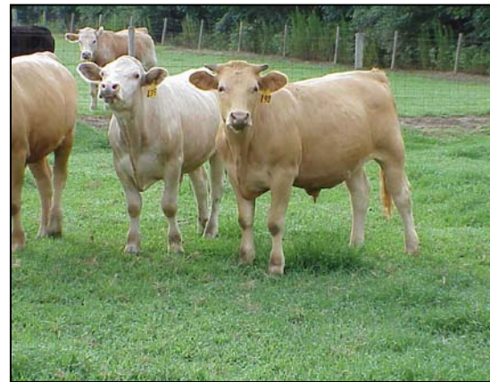
Stocker calves in a ‘Tifton 85’ grazing experiment at the CPES in Tifton, GA.

The most recent cultivar to be released from the CPES breeding program, ‘Tifton 85’ is the best bermudagrass cultivar since ‘Coastal.’ ‘Tifton 85’ is a sterile hybrid between a winter-hardy bermudagrass introduction and a highly digestible cultivar, ‘Tifton 68,’ that had been developed from two different lines of stargrass (a different species within the same family as bermudagrass). When grown as a hay crop, ‘Tifton 85’ produces up to two-thirds more forage per acre than ‘Coastal.’ Interestingly, when they analyzed the forage quality in their lab, they noticed that ‘Tifton 85’ had higher levels of fiber (NDF and ADF) than ‘Coastal.’ However, the digestibility of the fiber was much higher in the ‘Tifton 85’ than the ‘Coastal’ and, consequently, the ‘Tifton 85’ was actually found to be much more digestible than ‘Coastal.’