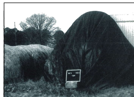
Tall fescue hay bales stored uncovered outside and under a tarp from May 9 to February 6.