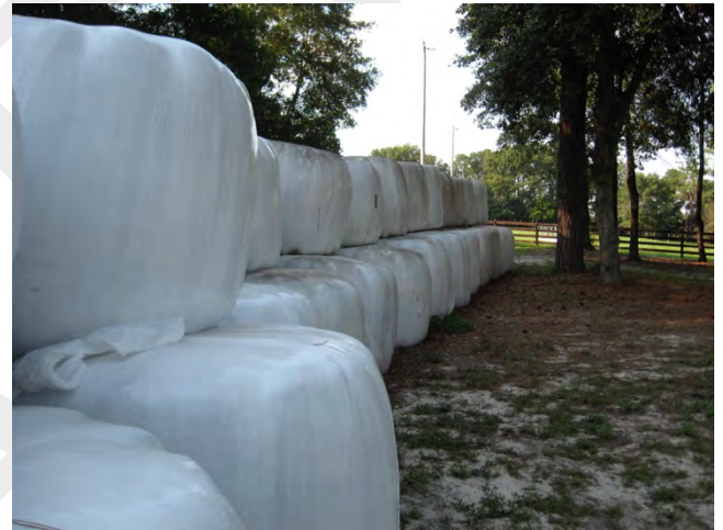
Figure 6. Individually-wrapped baleage bales wait to be fed.

Baleage bales that have a foul, rancid, or putrid smell to them are indicative of very poor fermentation. Such material may have even undergone a secondary fermentation, where the lactic acid formed early has been decomposed and butyric acid is formed. In extreme cases where the crop was excessively wet or the silage wrap failed to exclude oxygen, this secondary fermentation can result in botulism poisoning if the forage is fed to livestock. This is rare, but it can occur. So, be sure that the baleage that is fed passes the smell test. If it smells bad, test it for poor fermentation or botulism risk before feeding it!