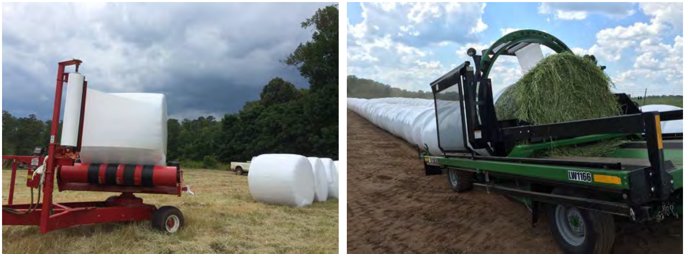
Figure 3. Examples of two basic categories of baleage wrappers: an individual bale wrapper on a trailer platform (left) and an in-line bale wrapper (right).