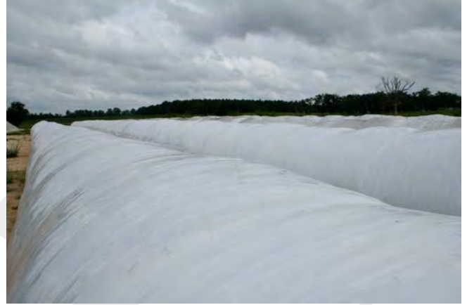
Figure 2. Uniform bales abut one another more evenly and lower the risk of compromising the plastic.

Another key consideration is to ensure that the size of the bales is appropriate for the size of the equipment used to transport and wrap the bales. Baleage bales will be roughly twice the weight of a hay bale of the equivalent size. Most producers find that a 4' x 5' bale is the most efficient size for their equipment, as these generally will be around 1100-1500 lbs.