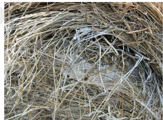
Figure 7. White mold is a harmless yeast, but molds that are green, blue, yellow, or red are indicative of a problem.

It is not unusual to observe some mold growth on baleage bales. Once the plastic has been removed, one may find molds of various colors on the exterior of the bale. One of the most common is white mold (Fig. 7). White mold is usually associated with baleage bales that were baled too dry to ferment well, but it can occur even if baled at the proper moisture level. It often grows on the flat sides of the bale or just under small holes in the plastic. White mold is a harmless yeast, usually in the Mucor or Monila genus. The mold spores for these species are too large to cause respiratory issues, and they produce no known mycotoxins. Livestock often will push this moldy material out of the way or consume it.