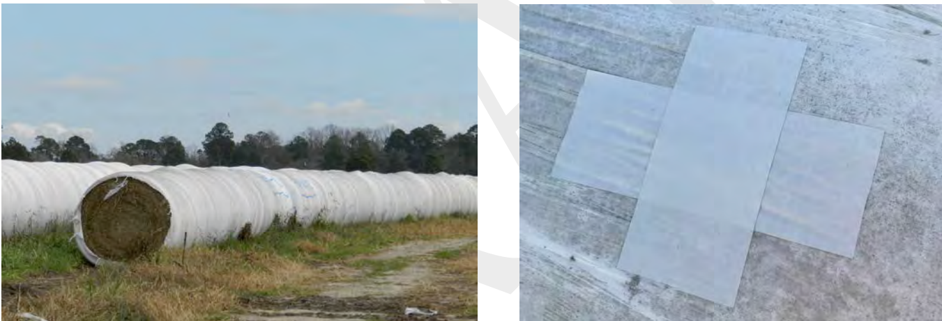
Figure 5. A good example of a well-chosen and maintained baleage storage site (left). It is important to select a storage site for baleage bales that is free of items that might poke holes in the plastic and to maintain the integrity of the plastic during storage. Minimize plant growth around the wrapped bales, as this often attracts birds, mice, or other vermin that might damage the plastic. Repair any holes that form by applying two layers of silage tape in a crossing (+) pattern to ensure adequate oxygen exclusion (right).

When choosing a site, the proximity to the field and to the site where the forage will be fed are equally important to consider. It is best to place the bales on a solid sod or along a firm roadbed so that adverse conditions during feed-out will cause minimal damage or soil disturbance (Figure 5). Bales should also be placed in an area so as to protect them from punctures. Avoid areas with stubs, exposed roots, or rocks. Groundhogs, birds, and other vermin will sometimes damage bales. By storing baleage in an open area and at least 10 ft from a fence-line, field borders, or other areas of shelter for wildlife, the bales will be less prone to damage from these pests.