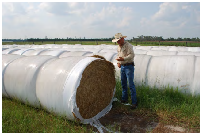
Figure 8. Plastic at the joints between baleage bales usually splits easily when a bale is lifted and hauled away.