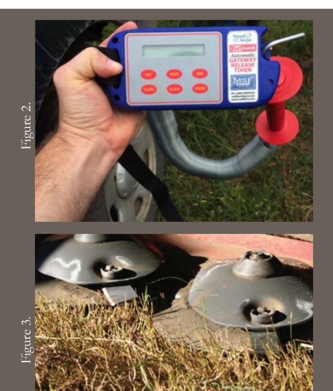
Figure 3. Leaving 3-4 inches of stubble going into the winter can greatly improve winterhardiness and spring green-up in bermudagrass.