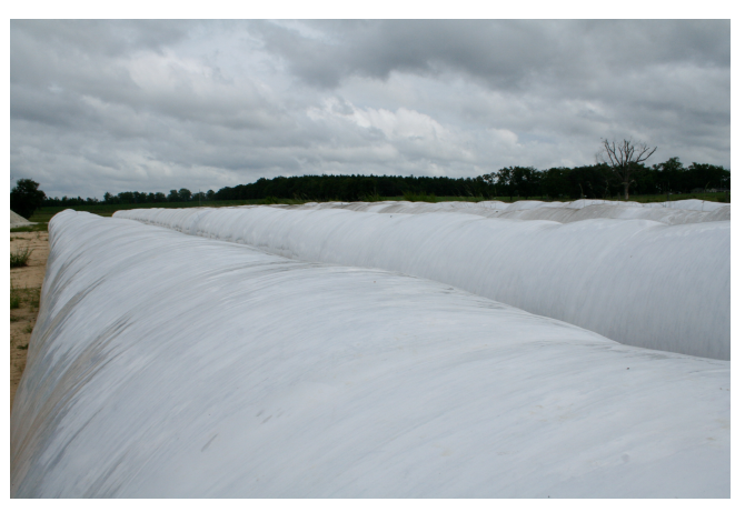
Figure 1. Uniform bales abut one another more evenly and lower the risk of compromising the plastic.

Dense and uniform bales greatly improve the conditions for proper fermentation. Densely packed bales enable the populations of desirable bacteria to build quickly and drop the pH faster. Dense bales also economize space in the storage area. Bale uniformity is also important. When wrapped with the stretch film plastic, bales with uniformly square edges have more consistent plastic coverage and, therefore, minimize oxygen influx (Fig. 1). Bales with uniformly square edges also align well with one another, which is especially important when wrapping with an inline wrapper. Irregularity between bales can cause oxygen intrusion where the bales adjoin one another. It is also a good idea to use net wrap when baling baleage bales.