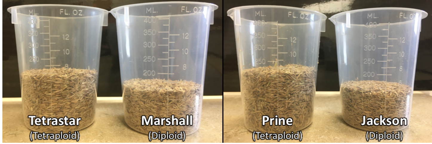
Figure 4 . Varieties of annual ryegrass differ in seed size, which will likely require adjustments to conventional and no-till grain drills to maintain the same seeding rate. Each of these beakers contains 20,000 seed of their respective varieties. Note that the seed of tetraploid varieties takes up approximately 50% more volume than the diploid varieties.