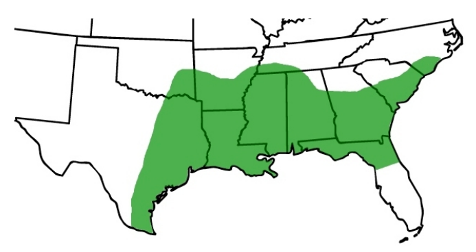
Figure 1. Annual ryegrass is frequently interseeded into bermudagrass and bahiagrass throughout the Southeast, as well as used as an annual forage or cover crop in other areas beyond the green-shaded areas.

From the outset, let us be clear that we are talking about annual ryegrass and not rye. Though a lot of folks refer to annual ryegrass simply as rye, these are two distinct species. Annual ryegrass ( Lolium multiflorum