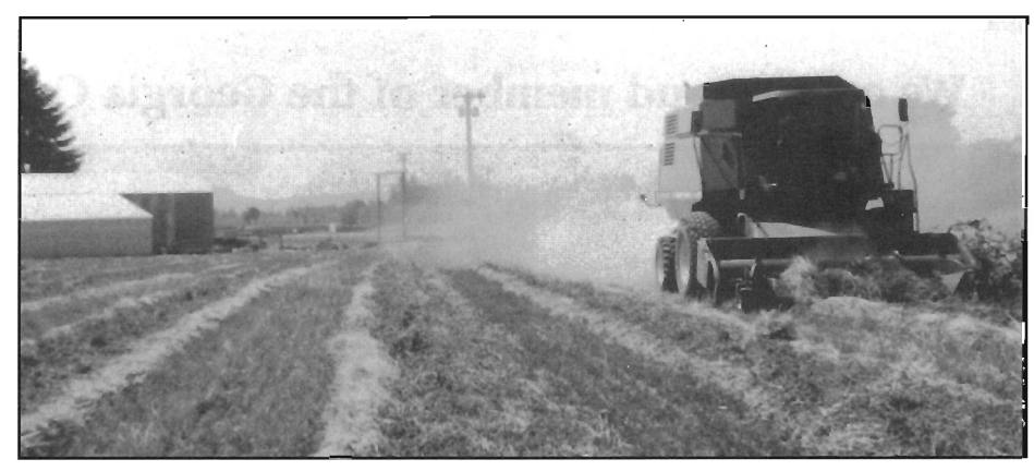
Harvesting swathed crimson clover seed in Willamette Valley of Oregon.

Although Georgia is not a significant forage seed producer, there is some production of certain species. This state is the main producer of rye seed, used widely for winter annual pasture. Some bahiagrass seed are produced by direct combining with yields of about 100 to 300 lb of clean seed/acre. Shattering is a problem and because of uneven ripening, rapid drying is essential to prevent heating damage to the seed. Crimson clover is also harvested with seed yields ranging from 100 to 300 lb/acre, the low yields a result of clover head weevil damage and wet weather at harvest. Arrowleaf clover is also harvested with yields ranging from 50 to 300 lb/acre, with losses due to rotting of excessive vegetative growth, wet weather at harvest in late June or July, and threshing losses from improper combine harvester adjustment. Sericea lespedeza is a very drought-tolerant legume but dry weather during the critical seed setting months of August and September often results in