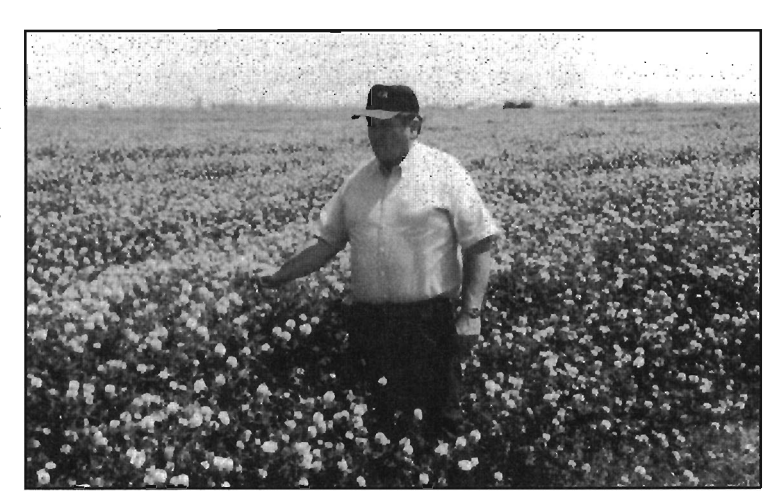
Yuchi arrowleaf clover seed field and grower in Willamette Valley, Oregon.