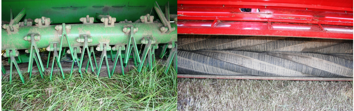
Figure 2. The two conditioner styles: impeller or flail-type (L) and roller-crimper (R).

2) Use a conditioner on the mowing implement. A conditioning-mower will greatly aid crop drying. Studies have shown that the drying rate of a hay crop is 15-25% better when a conditioner is used. There are two basic types of conditioners: an impeller (also known as flail) and a roller-crimper (Figure 2). The impeller conditioner uses v-shaped flails that whip around on a rotating drum, hit the forage, crack some of the stems, and scratch off some of the waxy layer (cuticle) on the outside of the leaves and stems, allowing the forage to dry quicker. The intermeshing rubber rolls of a roller-crimper conditioner crush the stems and leaves of the forage crop, exposing the inside of the stem (pith), and the mid-vein of the leaves to drier air, speeding the release of moisture from the crop.