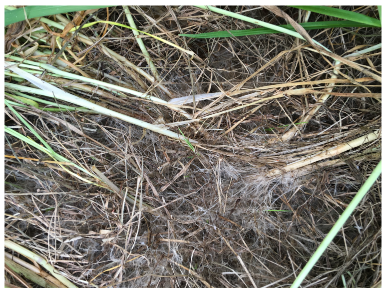
Figure 2. At the base of healthy ryegrass right, a mass of white adventitious roots and cobweb-like fungal mycelia develop just as it enters its most rapid phase of growth.

Despite these risks, annual ryegrass is a great forage and quite cost-effective because it reduces the need for winter hay feeding. However, one should have a plan to deal with the rapid spring growth rate. One helpful tactic is to reduce or avoid late winter or spring nitrogen (N) applications on a subset of one's paddocks. For