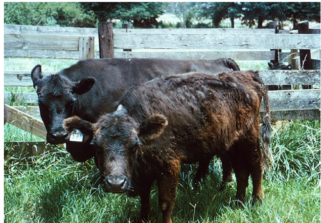
Figure 1. A heifer suffering from fescue toxicosis in the foreground and a heifer of the same age provided non-toxic, novel endophyte tall fescue in the background.

Of course, the biggest economic consequence is that animal performance suffers substantially. For example, cow-calf herds grazing toxic tall fescue often produce 30% fewer calves, and those calves may be 60 to 90 lbs lighter than cattle grazing the non-toxic, novel endophyte tall fescues (Table 1). These cattle seem to lag behind even after they make it to the feedlot. In a Georgia study, calves that had been backgrounded on toxic tall fescue ended up approximately 100 lbs lighter than similar calves on non-toxic tall fescue when they were finally shipped to a feedlot in Oklahoma, and they stayed approximately