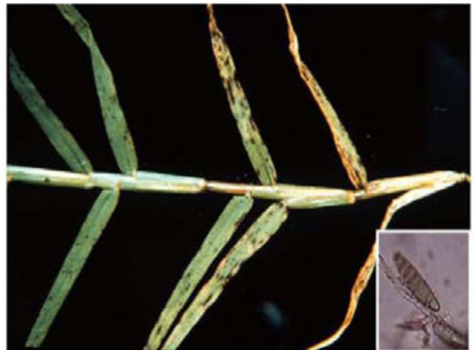
Figure 2. Helminthosporium symptoms on bermudagrass. Inset shows closeup of conidiophores.

Several environmental and biotic factors can reduce yield and quality of forage crops. Diseases are by far