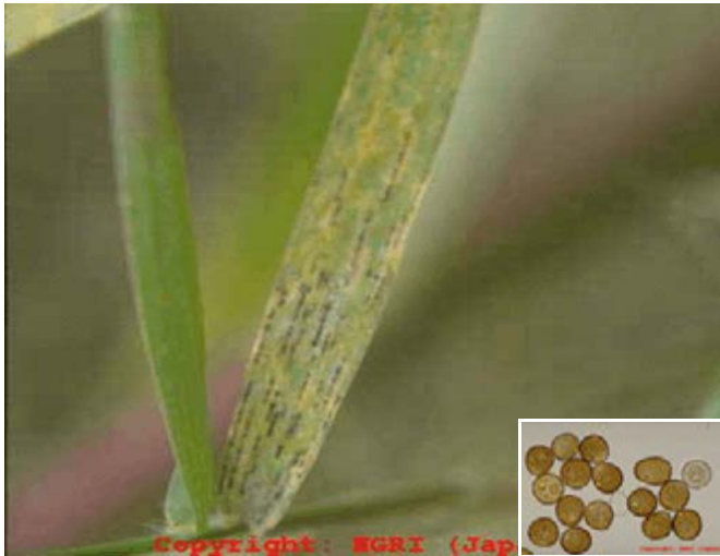
Figure 4. Puccinia or leaf rust on bermudagrass. Inset shows magnified conidiophores of leaf rust.

varieties are highly susceptible. While not a formal variety, common bermudagrass is often infected with leaf spot and is probably the most commonly reported susceptible “variety.” Most reported problems are in under-grazed pastures during late summer. Two improved varieties also appear to be extremely susceptible: Alicia and World Feeder. Note that both of these cultivars were introduced to Georgia from more arid areas of central Texas and Oklahoma. It is not uncommon to observe increased disease susceptibility when varieties originating from arid climates are introduced into more humid areas.