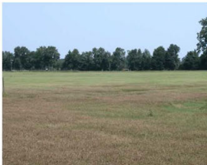
Figure 1. Alicia bermudagrass infected with Helminthosporium in Lowndes County, Georgia. Infected areas appear “bronzed” or red.

the most prevalent adverse factors affecting forages. Bermudagrass leaf spot is a disease that decreases yields, nutritive value and palatability. Bermudagrass leaf spot is caused by a fungus from the genus Helminthosporium and the disease has been informally called Helminthosporium leaf spot, Helminthosporium leaf blotch, or Leaf Blight. Recently, the genus Helminthosporium has been taxonomically reclassified into Cochliobolus (anamorph Bipolaris ) and Pyrenophora (anamorph Dreschlera ). Bipolaris cynodontis has been suggested as the probable causal agent of the disease. For identification and training purposes it continues to be known and informally named as Helminthosporium .