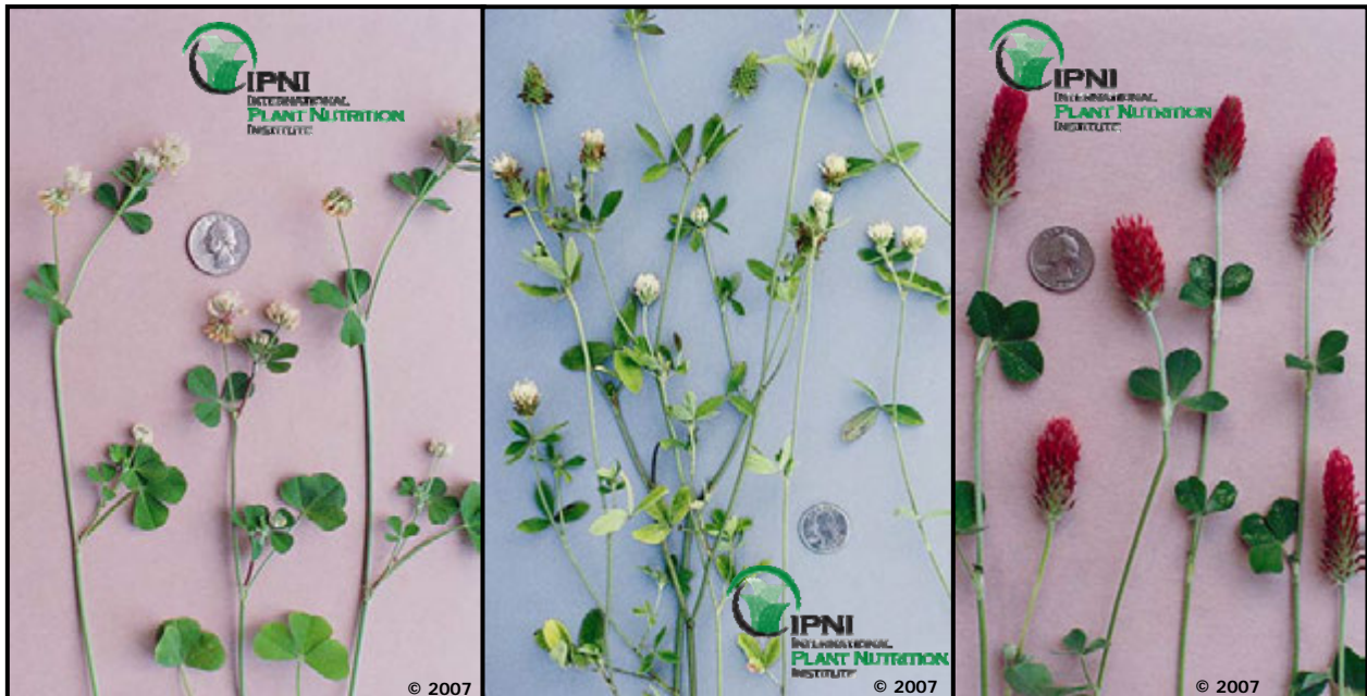
Ball Clover ( Trifolium nigrescens )

Crimson clover often serves as a benchmark for other cool season annual legumes. Crimson furnishes some grazing in late fall and winter and abundant grazing in early spring. Crimson matures (flowers) earlier in spring than other annual clovers, has a shorter grazing season and produces high yields even in cool winters. Several varieties are now available that mature very early, allowing it to grow, be used, add biologically-fixed N to the soil and die with minimal competition with warm season perennial grasses. It grows best on well-drained soils and is frequently used in mixtures with ryegrass and small grains for winter grazing. It is also commonly used to overseed bermudagrass and bahiagrass pastures. Unfortunately, crimson produces relatively little hard seed and its seed heads are often damaged by clover head weevils. As a result, crimson clover usually does not reseed well in a grazing system.