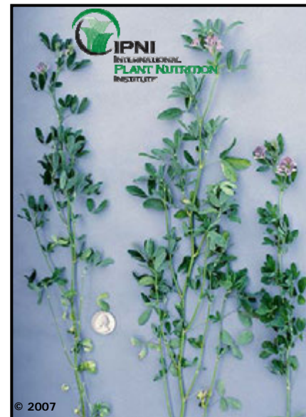
Alfalfa ( Medicago sativa )

For monoculture stands, it is best to seed alfalfa on a well-prepared, firm seedbed. On prepared land, plowing and disking operations should be done as needed to incorporate pre-plant applications of lime and fertilizer and to ensure a good, firm seedbed. A preemergence application of a labeled herbicide such as EPTC (Eptam) or benefin (Balan) is desirable (for currently labeled herbicides, see the Georgia Pest Management Handbook at http://www.ent.uga.edu/pmh/ ). Alfalfa may be seeded with a cultipacker-seeder (best) or a grain