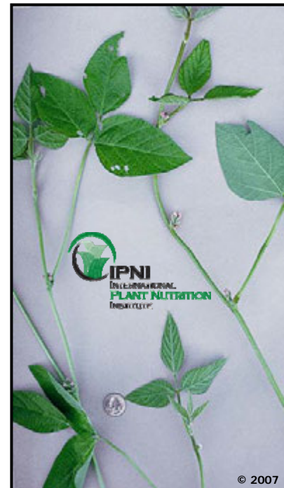
Forage Soybean ( Glycine max )

Forage soybeans are typically harvested for hay or silage; however, they can be used for late summer temporary grazing. Since they do not regrow once defoliated, strip-grazing (or frontal grazing) is the most efficient use. Soybean forage is fairly digestible (up to 60 percent) and moderately high in CP (17 to 19 percent). Stem size can be reduced, thus increasing digestibility, if seeding rates of 90 to 120 lbs. of seed per acre are used. Planting late-maturing varieties (maturity groups 6, 7 or 8) from early May to early June will result in forage soybean production best suited for high yields. Shorter periods of growth, such as part of a double- or triple-crop system, can be accommodated with early-maturing varieties. However, productivity is expected to be substantially less.