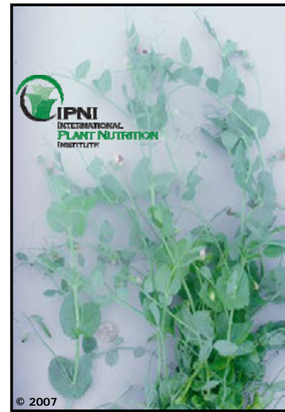
Winter pea ( Pisum sativum )

( http://www.caes.uga.edu/commodities/fieldcrops/forages/species.html ).