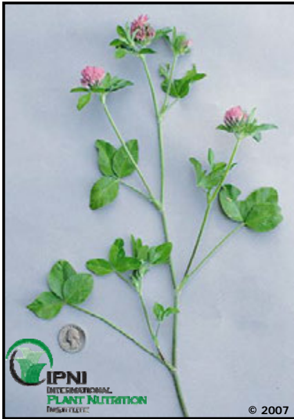
Red Clover ( Trifolium pratense )