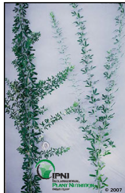
Sericea Lespedeza ( Lespedeza cuneata )

Sericea can provide moderate-quality forage; however, as the plant matures, the stems become taller, highly lignified and very woody. Late maturity will result in very poor forage quality that most animals will increasingly avoid. Therefore, sericea should be managed to keep the plants growing vigorously. Grazing should begin when plants are eight to 15 inches tall and should not be grazed closer than