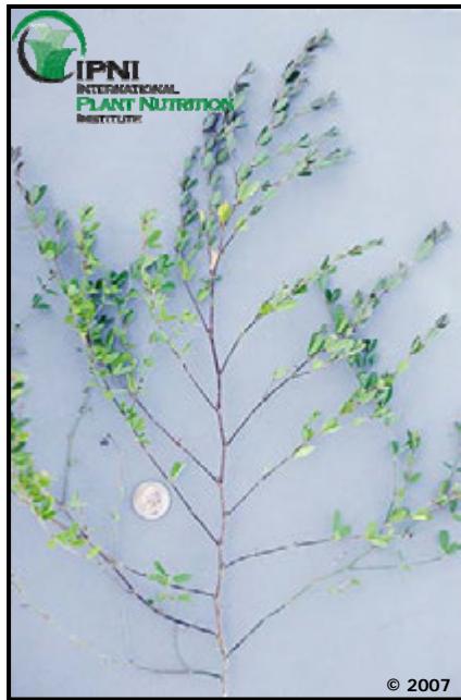
Striate Lespedeza ( Kummerowia striata )