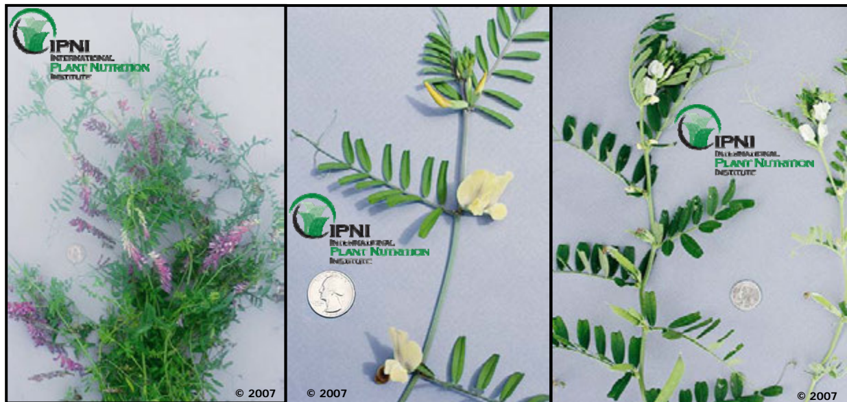
Hairy Vetch ( Vicia villosa )

Hairy and common vetch mature later in spring than crimson clover, but are cold-hardy, more tolerant of low soil pH than most clovers, and have a low bloat potential. Some common vetch varieties have been developed that are resistant to root-knot nematodes.