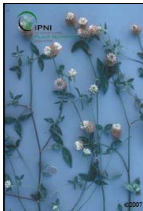
Arrowleaf Clover ( Trifolium vesiculosum )

Arrowleaf is a prolific seed producer, particularly of hard seed. To allow reseeding, remove animals from the paddocks or reduce stocking rates in late April or early May when the clover starts to flower. WARNING: If arrowleaf has been grown in a pasture for several years, its ability to reseed dependably is seriously compromised by a Fusarium spp. disease complex.