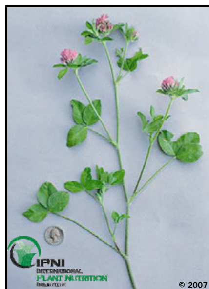
Red Clover ( Trifolium pratense )