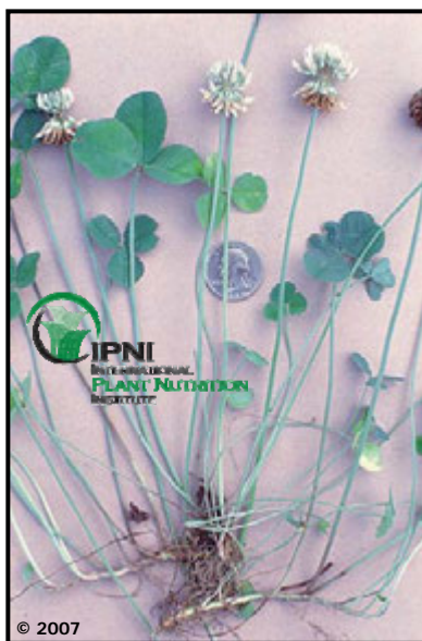
White clover ( Trifolium repens )

Red clover, a short-lived perennial legume, is adapted to a fairly wide range of soils. It is deep-rooted and, like alfalfa, does best on well-drained sites. It tolerates lower fertility and soil acidity than alfalfa, but persists better under good fertility. Red clover stands generally start to thin the second year. Some stands in Georgia have persisted for several years (most likely as a result of reseeding). Red clover is best adapted to heavy, fertile soils in north Georgia and can be seeded into tall fescue or orchardgrass stands with white clover. Red clover does not tolerate close grazing and will not produce or survive well in continuously-stocked pastures. Diseases also may limit stand life during cool, moist springs.