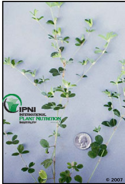
Korean Lespedeza ( K. stipulacea )