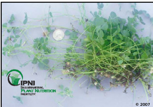
Subterranean Clover ( T. subterraneum )