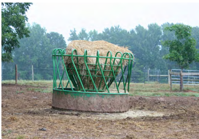
Fig. 2. Cone-style hay rings elevate the bales and minimize hay waste.