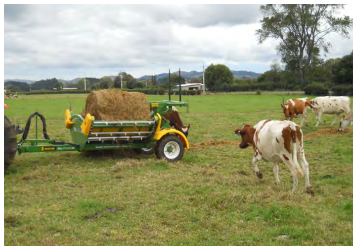
Fig. 1. Bale feeders can meter out just enough hay for 1-day and distribute it across the field.