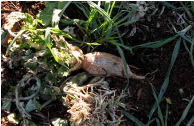
Figure 3. At the final grazing, cattle will often kick the bulbous taproots out of the ground and eat them.