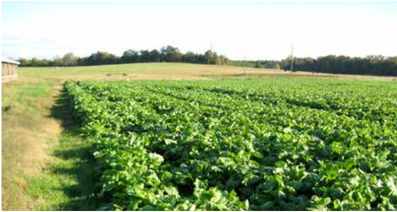
Figure 1. Even before the trees turn to demonstrate their fall colors, forage brassicas can provide a jump start on winter grazing.