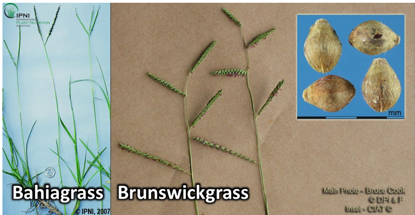
Figure 1. These bahiagrass and brunswickgrass specimens demonstrate substantial differences in the size, shape, and number of racemes in their seed heads, but they are harder to tell apart in the field. Even more challenging is separating the two species’ seed.

Brunswickgrass ( Paspalum nicorae ) is closely related to bahiagrass ( Paspalum notatum ). So close, in fact, that the casual observer would have a hard time telling them apart (Fig. 1). The seed produced by both species are so similar in size that it is practically impossible to separate the two when harvesting a seed field or cleaning the seed.