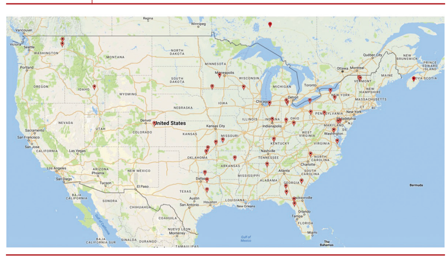
FIGURE 1 Approximate location of the respondents to the hay handling and hauling survey

Quality Net Wrap. Protection You Can Trust.