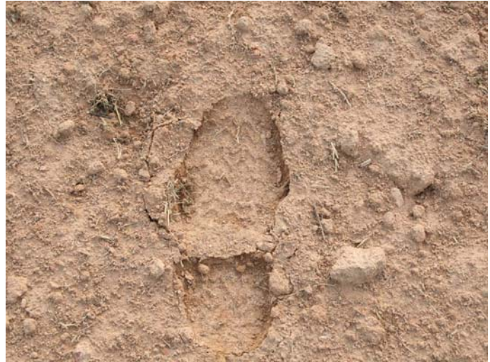
Figure 2 A boot-print in a well-prepared seedbed will be only 1/4 inch deep.

Whether using conventional or no-till methods, a little advanced planning is absolutely necessary. When conventional tillage is feasible, it offers the rare opportunity to address major problems in the field (smooth out ruts or high spots, incorporate the recommended amounts of lime/fertilizer, or perform deep tillage, if necessary). As a rule of thumb, complete all tillage operations at least 2 – 4 weeks ahead of the planting window, thus allowing the soil to settle and firm up prior to planting. If weeds sprout during this time, a finisher can be used but should be followed with a cultipacker to firm the soil. Always plant into a firm seedbed. A boot-print should only create a 1/4 inch depression (Figure 2). Soil that is too soft may dry out too quickly or result in seeds being planted too deep.