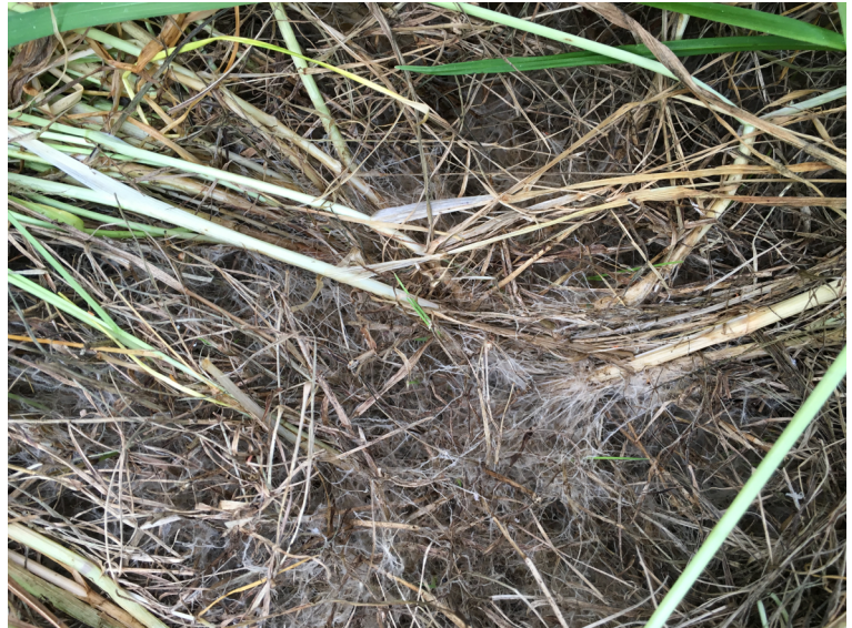
Figure 2. At the base of healthy ryegrass right, a mass of white adventitious roots and cobweb-like fungal mycelia develop just as it enters its most rapid phase of growth.

Despite these risks, annual ryegrass is a great forage and quite cost-effective because it reduces the need for winter hay feeding. However, one should have a plan to deal with the rapid spring growth rate. One helpful tactic is to reduce or avoid late winter or spring nitrogen (N) applications on a subset of one's paddocks. For example, one may have 10 paddocks in a rotationally grazed system and choose to not apply N to two or more of them after February. This will avoid promoting too much forage production.