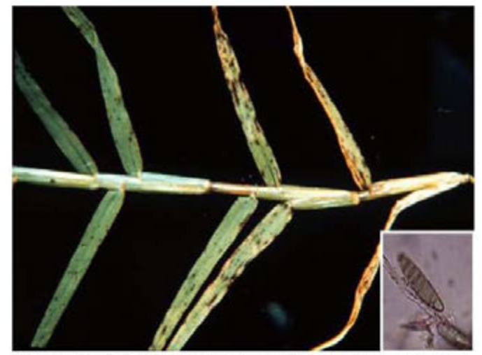
Figure 2. Helminthosporium symptoms on bermudagrass. Inset shows closeup of conidiophores.

the most prevalent adverse factors affecting forages. Bermudagrass leaf spot is a disease that decreases yields, nutritive value and palatability. Bermudagrass leaf spot is caused by a fungus from the genus Helminthosporium and the disease has been informally called Helminthosporium leaf spot, Helminthosporium leaf blotch, or Leaf Blight. Recently, the genus Helminthosporium has been taxonomically reclassified into Cochliobolus (anamorph Bipolaris) and Pyrenophora (anamorph Dreschlera). Bipolaris cynodontis has been suggested as the probable causal agent of the disease. For identification and training purposes it continues to be known and informally named as Helminthosporium.