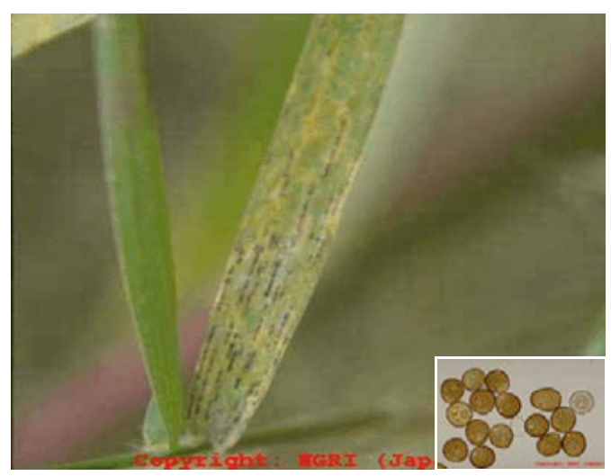
Figure 4. Puccinia or leaf rust on bermudagrass. Inset shows magnified conidiophores of leaf rust.

varieties are highly susceptible. While not a formal variety, common bermudagrass is often infected with leaf spot and is probably the most commonly reported susceptible "variety." Most reported problems are in under-grazed pastures during late summer. Two improved varieties also appear to be extremely susceptible: Alicia and World Feeder. Note that both of these cultivars were introduced to Georgia from more arid areas of central Texas and Oklahoma. It is not uncommon to observe increased disease susceptibility when varieties originating from arid climates are introduced into more humid areas.