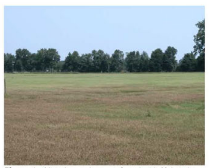
Figure 1. Alicia bermudagrass infected with Helminthosporium in Lowndes County, Georgia. Infected areas appear "bronzed" or red.

Several environmental and biotic factors can reduce yield and quality of forage crops. Diseases are by far