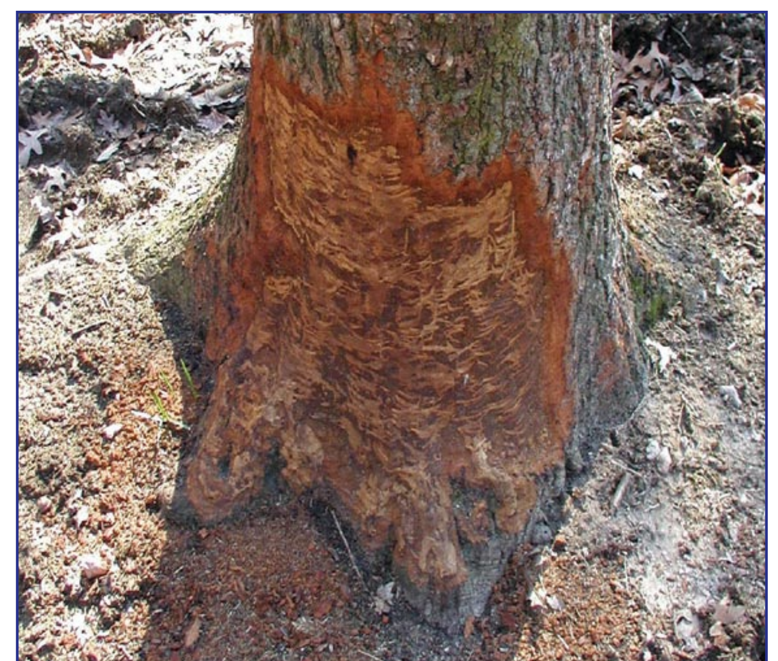
Trees must be fenced out to avoid girdling by horses. In this photo an unfenced tree has been fatally injured.

For more information on maintaining healthy horse pastures, contact your local Virginia Cooperative Extension Office or visit the Virginia Cooperative Extension website at http://www.ext.vt.edu/resources/ .