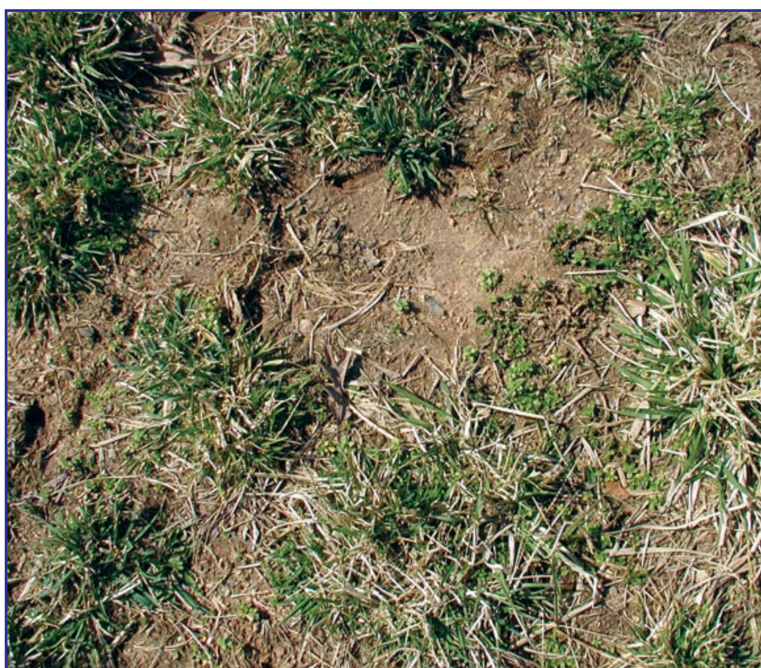
Close and frequent grazing weakened this sod, resulting in a pasture that is less productive and more susceptible to erosion and weed encroachment.