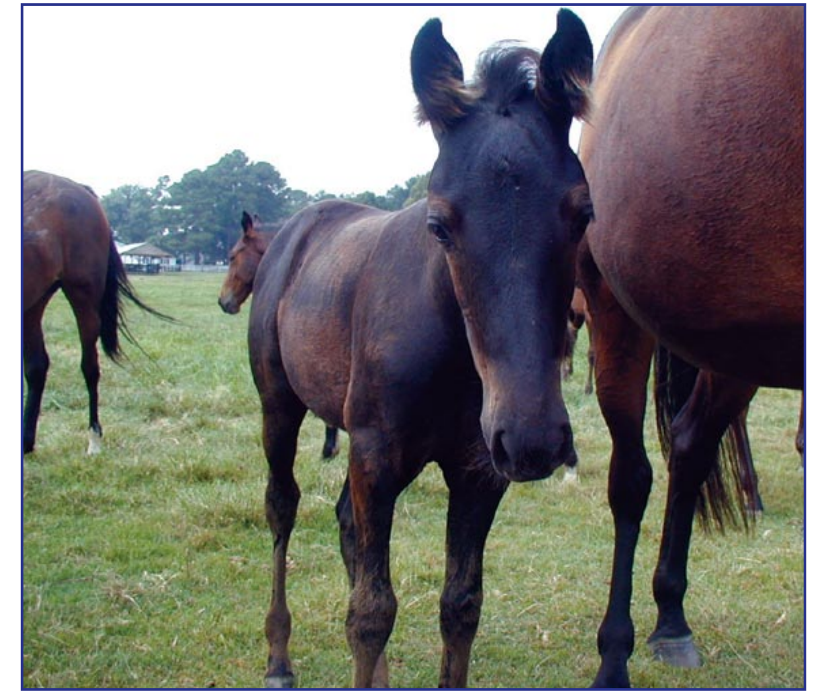
Healthy pasture sods supply a safe exercise surface for growing foals.

USE ELECTRIFIED POLYTAPE TO CONTROL GRAZING. For this type of fencing to be effective, it must be electrified at all times.