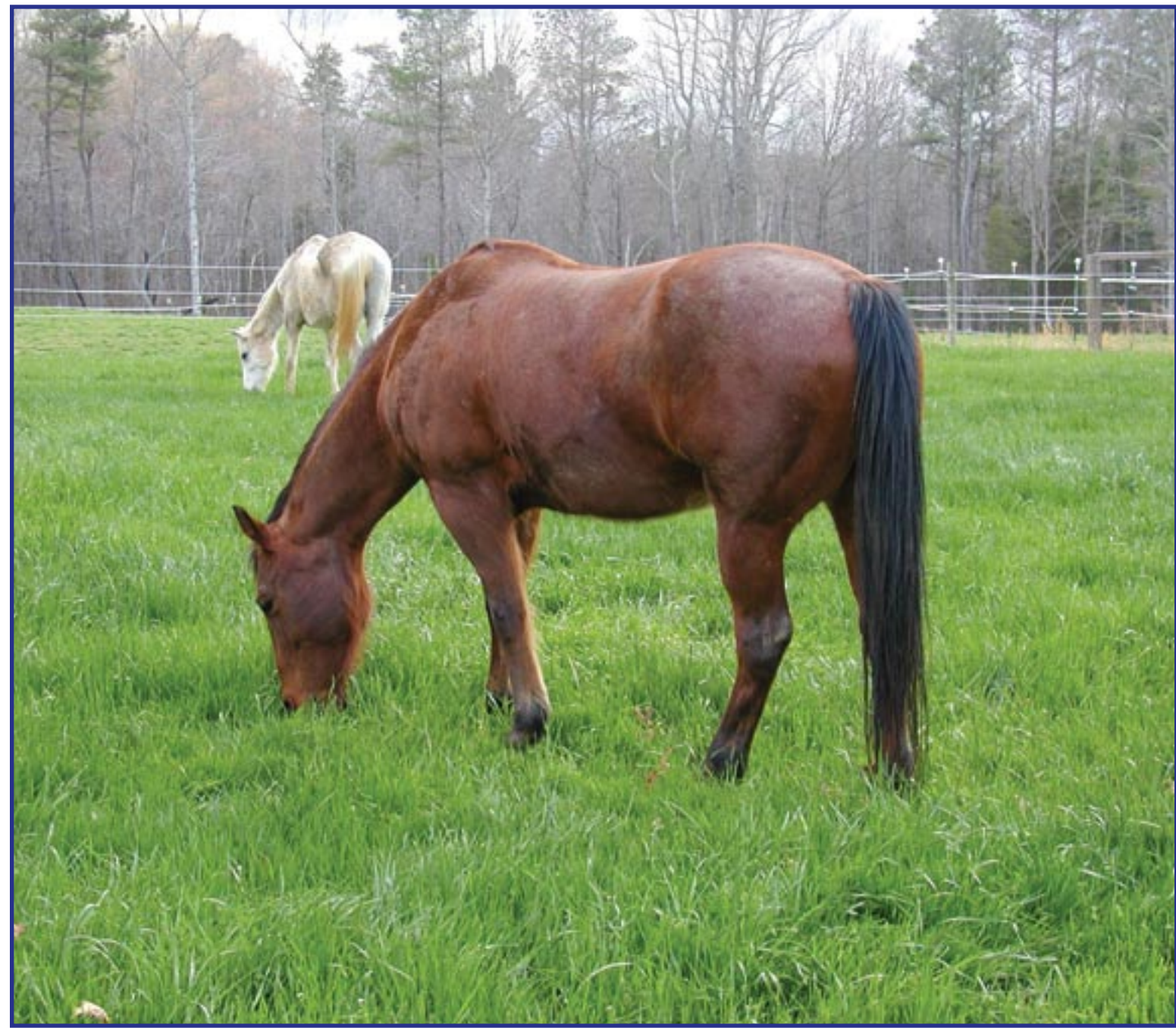
Well-maintained pastures can serve as an economical and high-quality feed source. Here a mature pleasure horse grazes contently in a field of annual ryegrass.