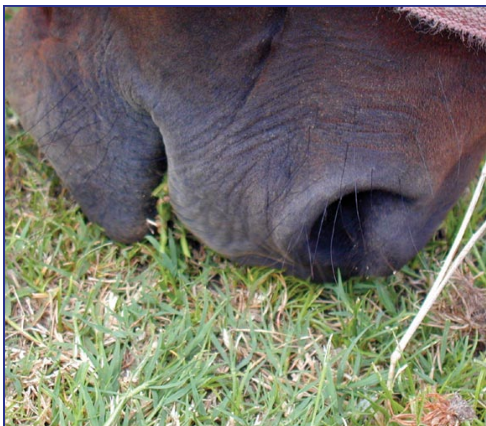
Horses can graze very closely. In this photo a horse grazes a bermudagrass sod too close.