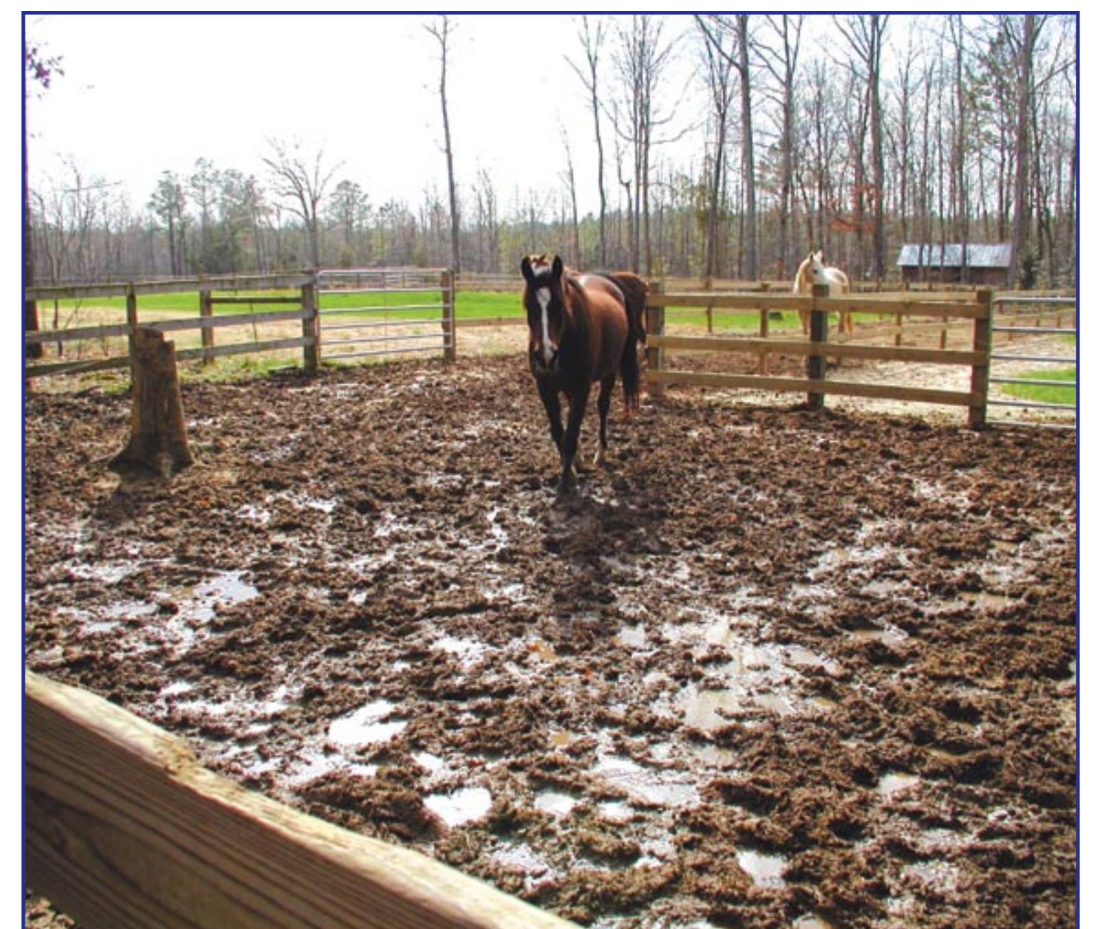
Sacrifice areas often become muddy and require the construction of a rock pad.